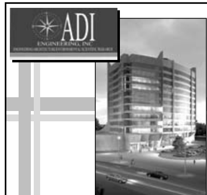
ADI's professional services were instrumental in the construction of the Zuma Entertainment Center.

Not Certified by the Texas Board of Legal Specialization *If you qualify. *Fees quoted above are minimum down payment needed to begin processing your case.