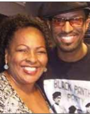
Radio Show Host Rickey Smiley

Visit Us Online at www.NorthDallasGazette.com