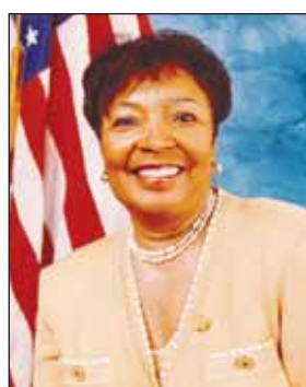
Congresswoman Eddie Bernice Johnson

"Students in other countries are outperforming American students in science and math," Congresswoman Johnson said. "As Members of Congress, we have a responsibility to improve math and science education in our schools, both for the sake of our young people and for the sake of