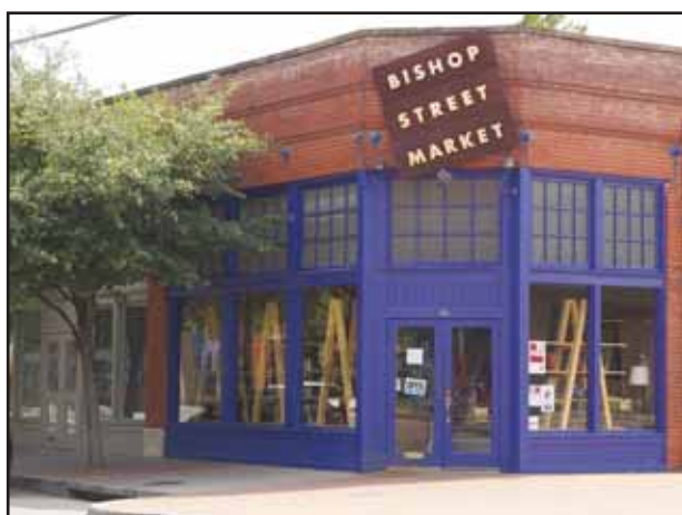
Bishop Arts District Market

Baptist Church, Antioch Baptist Church and Inspiring Body of Christ Church, the Southwest Police Officers and others.