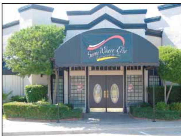
Somewhere Else Restaurant and Bar