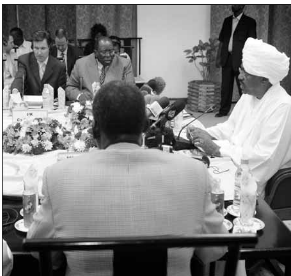
President Omar El-Bashir, right, meets with visiting delegation of U.N. Security Council ambassadors in Khartoum, Sudan