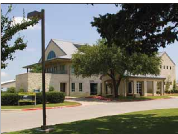
Cedar Crest Golf Course