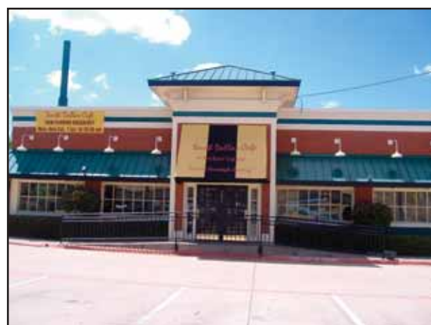
South Dallas Cafe