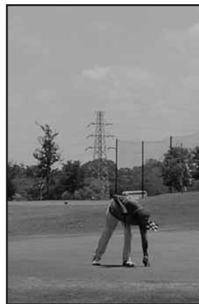
Golfer at Cedar Crest

Oak Cliff has been a part of the City of Dallas since its annexation in 1903. It was originally incorporat-