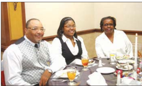
Friends and family enjoy the evening of celebration.