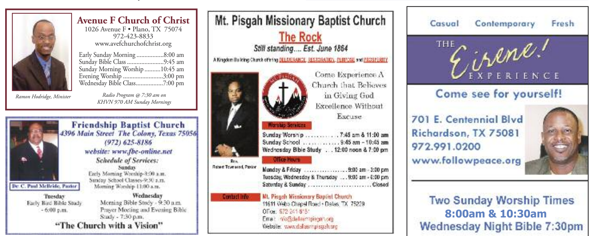
January 28 - February 3, 2010 | North Dallas Gazette | visit us online at www.NorthDallasGazette.com | 15

to learn about all options available in their areas and to help put Texas Back to Work. Employers also are encouraged to take advantage of WorkInTexas.com, TWC's online job matching Web site where more than 250,000 employers post job openings and find great employees. Local workforce board contact information can be found on www.twc.state.tx.us /dirs/wdbs/wdbmap.html or by calling 512-463-8556