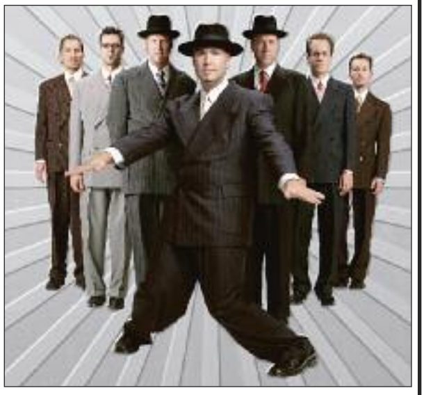
See VOODOO, Page 9