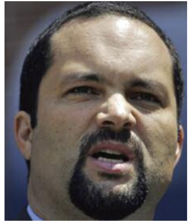
Benjamin Todd Jealous, NAACP President

What's more, it can lead students from those ethnic groups to have a skewed picture of themselves and their place in the world. Studies of high school dropout rates out have shown that students became disengaged with classes because what they were learning didn't seem relevant to their lives. And in a 2006 national study, more stu-