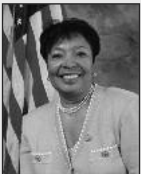
Eddie Bernice Johnson

(NDG Wire) Congresswoman Eddie Bernice Johnson's cable show has a new look and a new name.