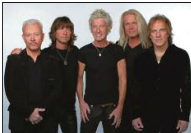
Legendary rock band, REO Speedwagon will appear at Liberty Fest Memorial Day weekend, May 28-29 in Farmers Branch.

The assortment of events at Liberty Fest will concentrate on Americana and will include an Old Fashioned Carnival and Midway; a Backyard Barbeque Grill-Off competition; a Car, Truck and Motorcycle Show; 7-on-7 flag football tournament; Fishin' Fun; tours of the Farmers Branch Rose Gardens; and a free fi-