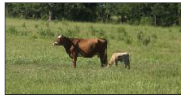
The cow followed her trail back to where she left her calf; she then got back on track of showing her calf how to graze and find the rest of the herd.

The process then is for the Christians to go to God in prayer and resolve the issue of not fully believing God. Christians can feel free to share their feelings with God. What Christians need to remember is that God knew they would be at this place in their lives and He had already made allowances for this, a way of escape. However, once they have done this, failing to fully trust God, they must let go of the situation and allow God to work in their hearts the grace that is needed to walk in complete trust and freedom.