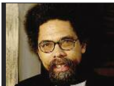
Dr. Cornel West