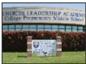
Choice Leadership Academy campus

(NDG Wire) Building lifelong learning skills for college and beyond through advanced academics, leadership development, technology and cultural arts has earned national accreditation for Choices Leadership Acad-