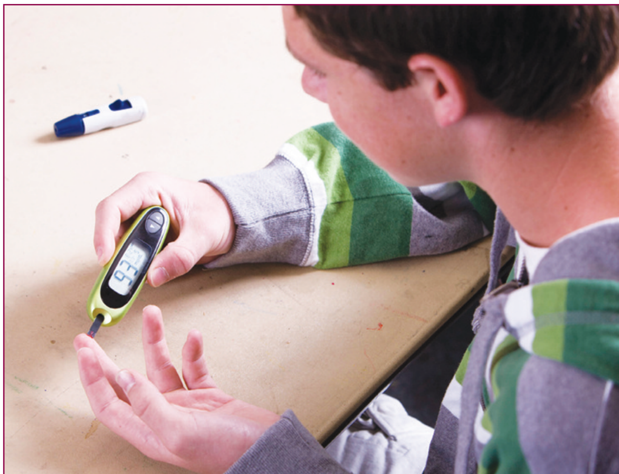
A teenager tests his blood sugar with a glucose meter. Keeping blood sugar close to the normal range can help prevent the complications of diabetes.

controlled with diet and exercise for a while—sometimes years—says Irony. “But the disease is progressive and medication will be needed later in the majority of patients.”