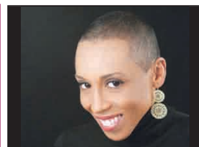
Andrea Davis Pinkney