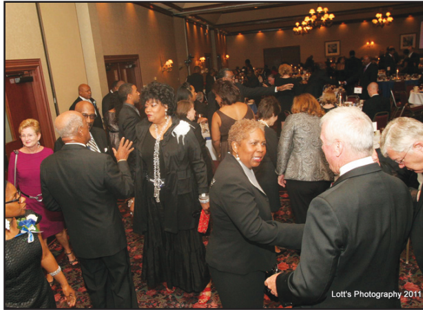
Plano Community Forum Attendees