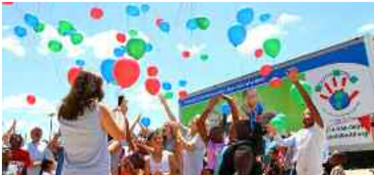
Balloons are released to celebrate then 100,000th free meal served at Youth World by the Dallas ISD Summer Food Program.

To find where free meals are offered this summer, visit the Dallas ISD Summer Meals page, which offers a location tool.