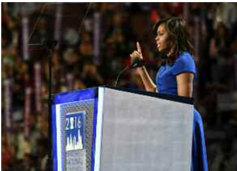
First Lady Michelle Obama speaks to the crowd at the Democratic National Convention. By all accounts, her speech was one of the most riveting delivered during the event.

The 2016 Democratic Party convention has spotlighted the fact the ladies are in charge! Despite a skirmish which led to the ouster of Debbie Wasserman Schultz as the head of the Democratic National Committee, it was quickly handled, with the interim appointment of Donna Brazile. Then on Monday night rising star Sen. Elizabeth Warren perhaps did not have her best performance, but First Lady Michelle Obama was applauded for building a strong case for support in why Americans should choose Hillary Clinton in November.