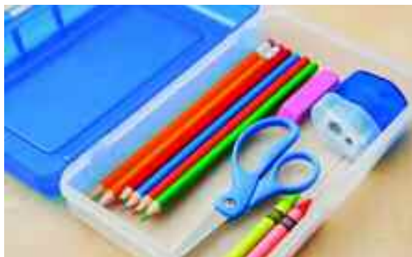
The Garland NAACP along with Garland ISD will be hosting a Back-to-School fair on Aug. 20.