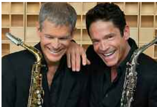
David Sanborn and Dave Koz are set to make great music

In the 25 years since the release of his self-titled solo debut album, saxophonist Dave Koz has received nine GRAMMY nominations, had nine No. 1 albums on