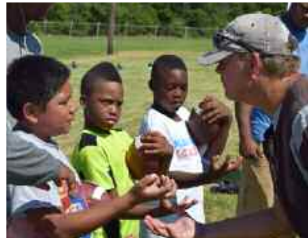
Dallas Champions Academy Camp gave youngsters the opportunity to work with NFL and NCAA coaches to improve fitness as well as to catch up on a multitude of life skills.

The Dallas Champions Academy is a nonprofit dedicated to teaching underprivileged children and youths aged 8-18 four life principles through sports: discipline, respect, trust and hard work. Now in its