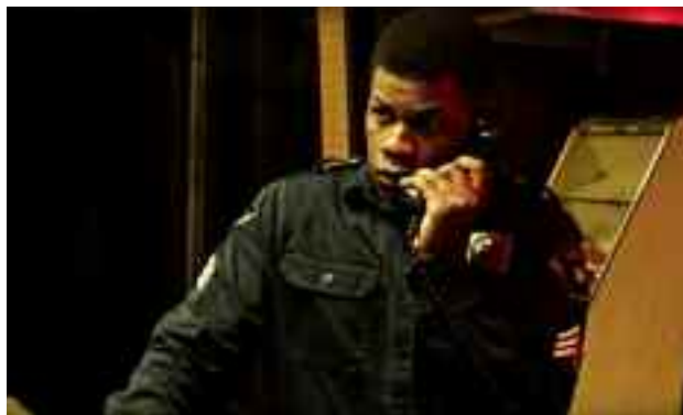
John Boyega is a local security guard caught in the crossfire.

The back drop for the movie Detroit is a hot summer night in a northern city where many blacks family have fled to escape the discrimination and segregation of the Deep South. Meanwhile, the great northern migration of blacks from the rural south as they seek to find work and a better way of life in the thriving auto industry in the Motor City, Mo-town – Detroit. A southern exodus fueled by relatives and friends returning to the south sharing the