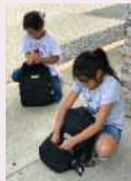
100 Irving school children on Aug. 7 received a free backpack filled with supplies and a coupon for a free meal from Pollo Campero.

Shoe Giveaway – Oak Gardens Church at 4008 S. Polk Street in Dallas is giving away shoes while