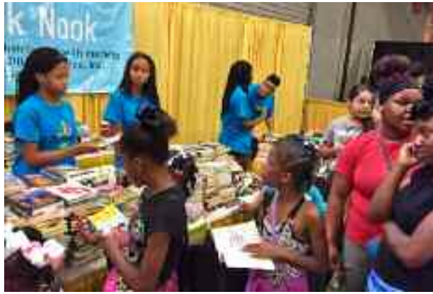
Children and their parents not only received school supplies but books to read donated by Half Price Books and distributed at the Mayor's Back to School Fair by volunteers from the Dallas Chapter of Jack and Jill.

In those days school supplies seemed a lot simpler, the biggest decision was what Trapper Keeper you would pick out, the color of your folders and if you could get one of the cool pens. Now, back to school fashion is at an entirely new level and even when dis-