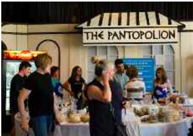
The Greek Food Festival of Dallas will return this year with a variety of food options, live music, and art for sale

Holy Trinity Greek Orthodox Church will be hosting the Greek Food Festival of Dallas on Friday, Sept. 22 from 12 p.m. to 11 p.m. at 13555 Hillcrest Rd, Dallas. Food samples prepared by Holy Trinity's own cooks will be available as well as a coffee and pastries area. The event will feature traditional folk dancing and music, cooking demos, children's activities, and a marketplace with art and unique