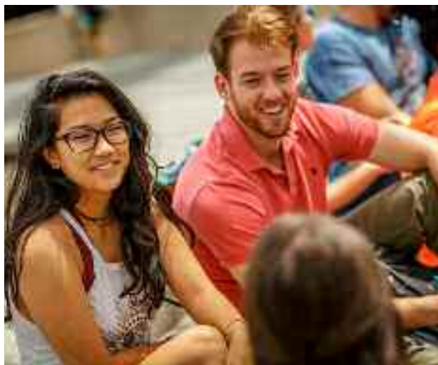
UT Dallas earned high marks for its value and campus ethnic diversity from U.S. News & World Report .

U.S. News & World Report evaluated nearly 1,400 U.S.-based colleges on up to 15 measures of academic quality. The calculation of best value takes into account academic quality and