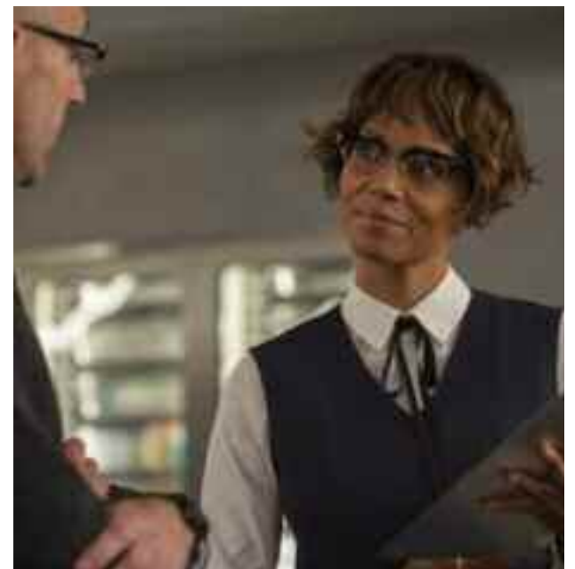
Halle Berry is part of a star-studded cast in Kingsmen 2: The Golden Circle

Kingsmen 2 opens Sept. 22 in theaters nationwide. Parents, please note this film is rated R for mature audiences only.