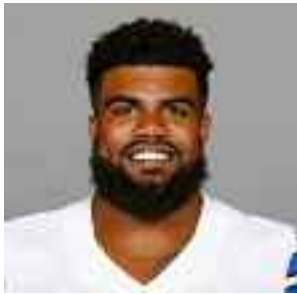
Dallas Cowboys Running Back Ezekiel Elliott

Case in point, during the Dallas Cowboys' embarrassing 42-17 road loss to the Denver Broncos on Sunday, running back Ezekiel Elliott was heavily criticized for not at least trying to chase down two Broncos defenders who intercepted a couple of passes thrown by