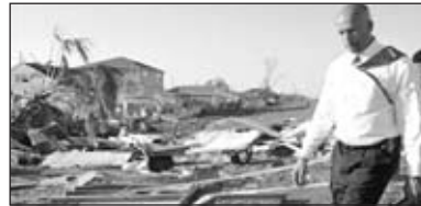
New Orleans Mayor Ray Nagin in the Pontchartrain Park neighborhood of New Orleans, February 13, 2007. City officials unveiled a $1.06 billion plan on Thursday to rebuild their city, saying they could no longer wait for federal aid 19 months after Hurricane Katrina.

"We're not sitting around waiting for anybody any longer," Nagin said in a news conference. "We're going to move this city forward with the resources that we can generate creatively, and everybody who