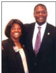
Picture of The Week Sister Tarpley and Craig Watkins, the First Black District Attorney in Dallas County and Texas.

The winds of the spirit are always blowing. Are we opening windows,