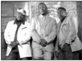
The O'Jays Eddie Levert, Walter Williams, Eric Nolan Grant.

& Huff's Philadelphia International Records, Backstabbers , was a masterpiece, highlighted by McFadden & Whitehead's master composition, "Backstabbers." The haunting song with the great intro (later sampled by Angie Stone on "I Wish I Didn't Miss You") became a monster hit, and was followed by the even bigger "Love Train." The Backstabbers album was a