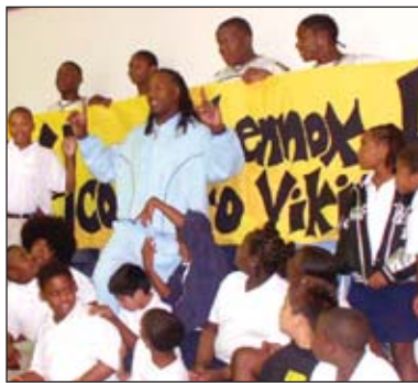
Lennox Lewis loves his sign from the West Dallas students.