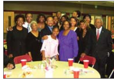
Some family members from all over the United States.