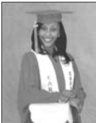
Favorite "Best All Around"

Hostess at Apollo Live at Carter High School, Class