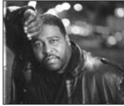
R & B legend, Gerald Levert who lost his life to accidental

lies and healthy communities we will launch the start of Black Music Month with a tribute to