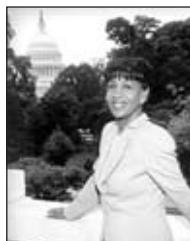
Congresswoman Maxine Waters