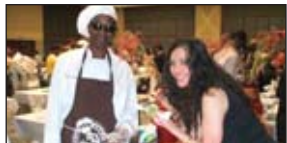
Enjoying the flavor of a Real Men culinary delights.