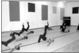
Students enhance their skills in the Modern dance workshop.

Texas attended the 2007 dance enrichment workshop, with the theme "Dance: Igniting the Power of