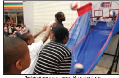
Basketball was among games play to win prizes during Family Night Carnival.

Learners Enjoying Vacation Bible School during Citywide VBS hosted by Saint Mark Baptist Church. Vacation Bible School, one of the greatest opportunities to reach all people, especially children and preschoolers during the summer months. It continues to be one of the most productive special events in terms of both finding prospects and leading them to the Lord. This year's VBS had over two