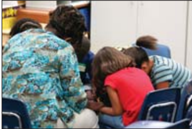
Students and teacher have group prayer before beginning class.