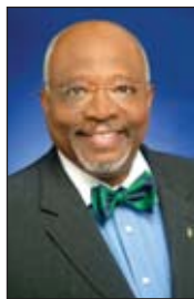
Board Member Of The Year Page 4