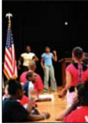
Opening Night Worship Rally.