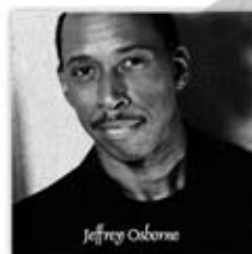
Jeffrey Osborne We're Going All the Way