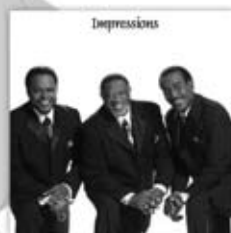
The Impressions People Get Ready

Call 214.915.4600 for Ticket and Sponsorship Information.