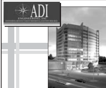
ADI's professional services were instrumental in the construction of the Zuma Entertainment Center.

WE PROVIDE PROFESSIONAL ENGINEERING, ARCHITECTURAL, ENVIRONMENTAL AND SCIENTIFIC RESEARCH SERVICES TO THE WORLD