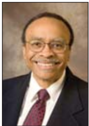
Christian Chapel CME Church will host a unique lec-