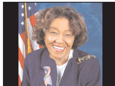
Rep. Julia Carson