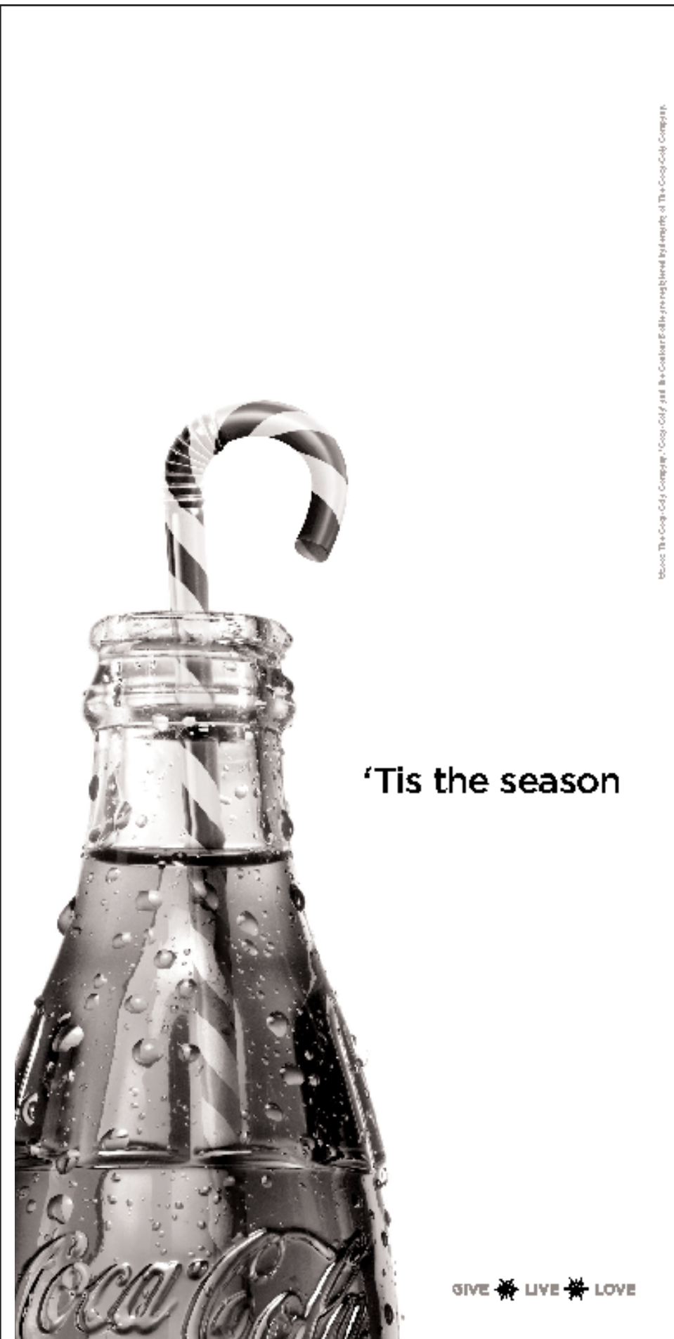
"Coca-Cola" just like Colgate® is a registered trademark of The Coca-Cola Company.