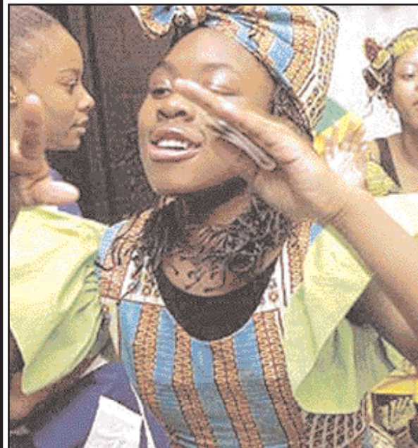
See Kwanzaa, Page 9