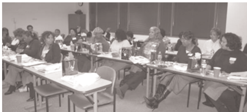
Audience at Links, Incorporated