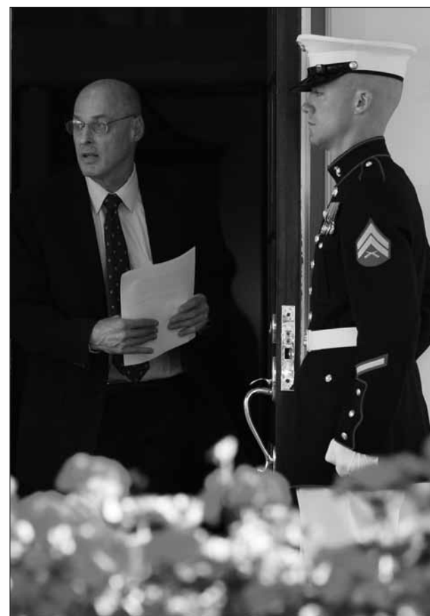
Treasury Secretary Henry Paulson, left, walks out of the West Wing of the White House in Washington to brief reporters after his meeting with President Bush regarding the defeated a $700 billion bailout bill, Monday, Sept. 29, 2008.

Try brainstorming with friends and family. Invite them to come up with any ideas (it does not matter how silly some of them may sound). A brainstorming session should last no longer than fifteen minutes.