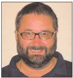
by Rick Elina

First, here's a thought for the day. It's one that's hotly debated anytime a multi-generational discussion ensues regarding art. Two opposing camps quickly emerge, vigorously taking disparate sides regardless of the art form in question; music, painting even theatre. At the heart of the debate, the central question becomes, which school of thought best serves the basic human need to self-express? Is it the classic school of thought or the modern school of thought? Or simply put in the language of today, old school or new school? The classic treas-