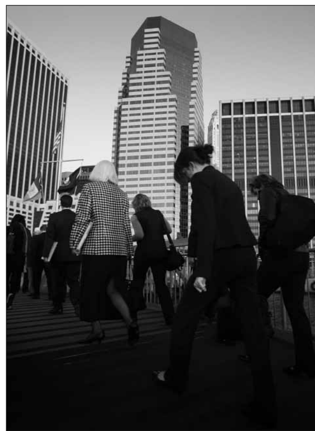
Early morning commuters arrive by ferry to Wall St. and New York's financial district Tuesday, Oct. 7, 2008. Wall Street looked to recover Tuesday from a huge sell-off the previous session after the Federal Reserve unveiled plans to buy massive amounts of short-term debt to reanimate the credit markets.

the economy is experiencing job losses, from factory jobs, to service jobs, to jobs in the financial services industry. Only in health care and government services to jobs continue to grow. There is barely a safe haven for those who are losing their jobs. The economic policy institute cites one piece of legislation as providing possibilities for those at the bottom.