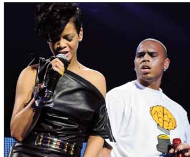
In a Dec. 12, 2008 file photo singers Rihanna and Chris Brown perform at Madison Square Garden in New York. Brown, who was arrested a week ago in connection with a domestic violence investigation, said Sunday Feb. 15, 2009 he is "sorry and saddened" by what happened and is seeking counseling from his pastor and loved ones.

Information from People.com contributed to this report.