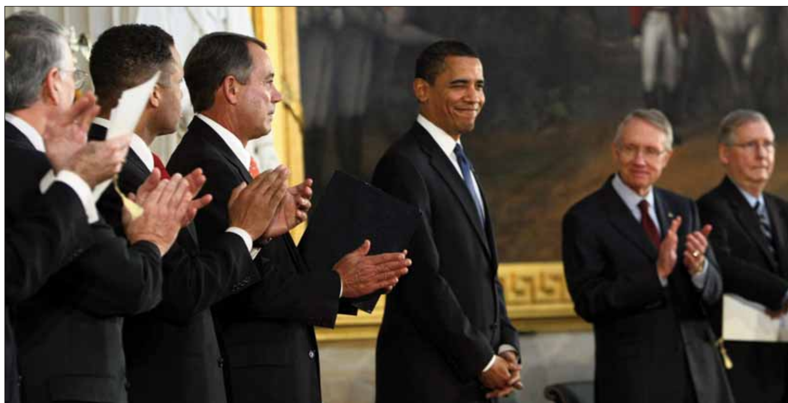
With a statue of Abraham Lincoln peering, President Barack Obama smiles in the Rotunda on Capitol Hill in Washington, Thursday, Feb. 12, 2009, while attending a Congressional ceremony celebrating Abraham Lincoln's 200th birthday. From right are, Senate Minority Leader Mitch McConnell of Ky., Senate Majority Leader Harry Reid of Nev., the president, House minority Leader John Boehner of Ohio, and Rep. Jesse Jackson Jr., D-Ill.

But he spoke in the House as bad economic news continues to pile up. Some 3.6 million jobs have disap-