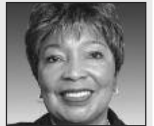
Congresswoman Eddie Bernice Johnson

The webinars will focus on a number of personal finance topics including information on recession-proofing your finances, protecting investments during a recession, understanding the credit card act, credit scores, basic money management,