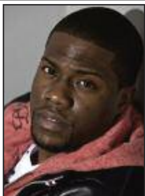
Comedian Kevin Hart