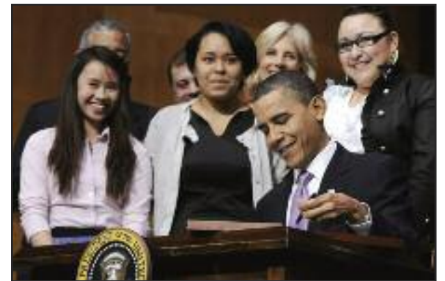
Students and faculty from Northern Virginia Community College surround U.S. President Barack Obama as he signs the Health Care and Education Reconciliation Act into law in Alexandria, Virginia.