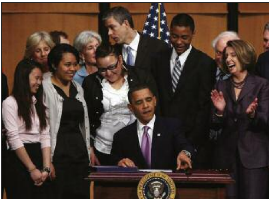
U.S. Speaker of the House Nancy Pelosi (D) applauds after U.S. President Barack Obama signed the Health Care and Education Reconciliation Act of 2010 during a signing ceremony at Northern Virginia Community College March 30, 2010 in Alexandria, Virginia. The legislation modifies the health care reform signed by President Obama at the White House last week, and adds additional language significantly changing the process of student loans, following passage by the House of Representatives and Senate.