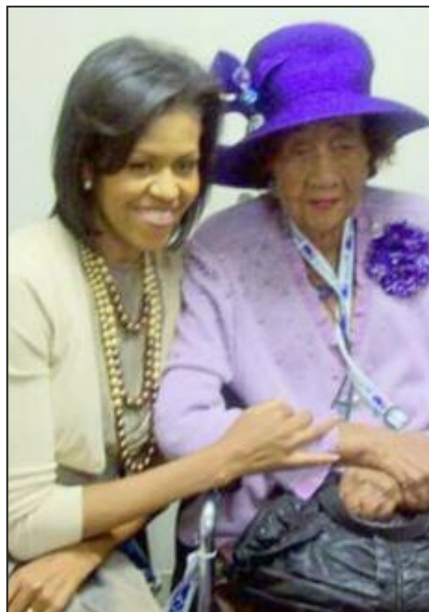
Civil rights leader Dorothy Height and Michelle Obama stole a few minutes together in Denver at the Democratic Convention September 3, 2008

one who comes behind such a historical legend as Mary McCloud Bethune able to fill those shoes. Dorothy Height was not only able to fulfill her dreams, but to propel new dreams for new generations to come. And that truly is her legacy."