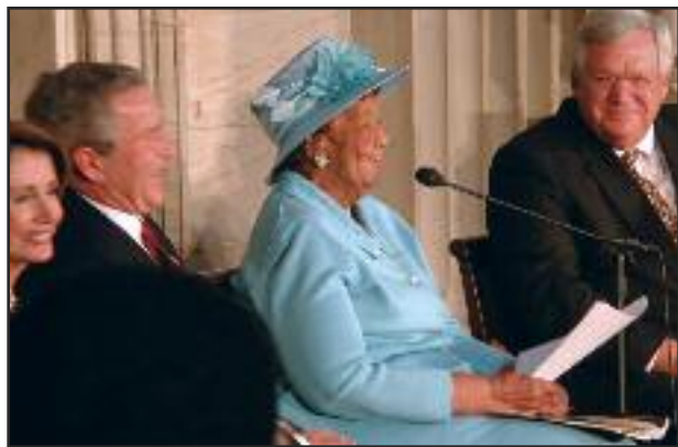
Dr. Dorothy Height, President Emeritus of the National Council of Negro Women on Feb. 14, 2006 just 38 days before her 95th birthday.