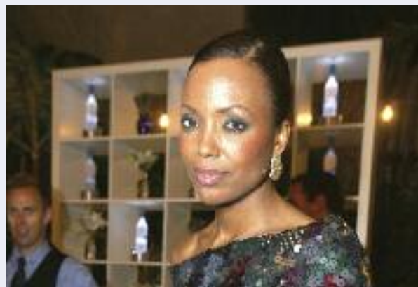
Aisha Tyler.

(NDG Wire) On Friday, September 17 Grey Goose, hosted an intimate cocktail party for Aisha Tyler's 40th birthday at Vibiana in downtown Los Angeles.