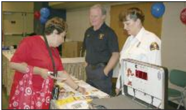
Crime prevention information will be part of the offerings at the National Night Out community crime fighting event. The event will also feature free refreshments, prostate cancer screenings, and giveaways from 11 a.m. to 2 p.m.