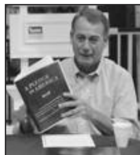
Congressman John Boehner

cession could have been worse than the Great Depression -- an economic hurricane instead of a bad storm. They opposed the Recovery Act. They opposed healthcare reform. They opposed ending tax breaks for companies that ship jobs overseas. They even opposed 7 of the 8 tax cuts Congress has passed to help small business owners.