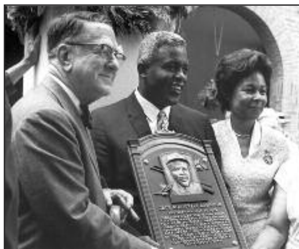
Branch Rickey, Jackie Robinson and his wife Rachel

Just what makes that little old ant. Think he'll move that rubber tree plant. Anyone knows an ant, can't.