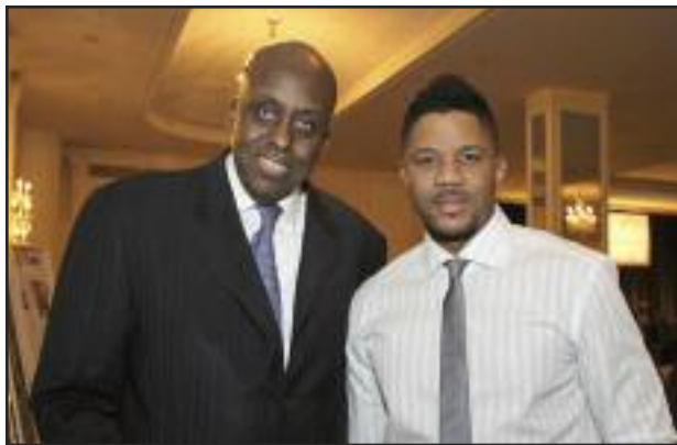
Actor Hosea Chanchez (right) with film director Bill Duke attend an event at the Congressional Black Caucus' Annual Legislative Conference held September 15-18, 2010 in Washington, DC.

Television host Niecy Nash, actress Wendy Raquel Robinson, Hosea, and actress/comedienne Kym Whitley attend an event during the 2010 CBC Annual Legislative Conference in Washington, DC.