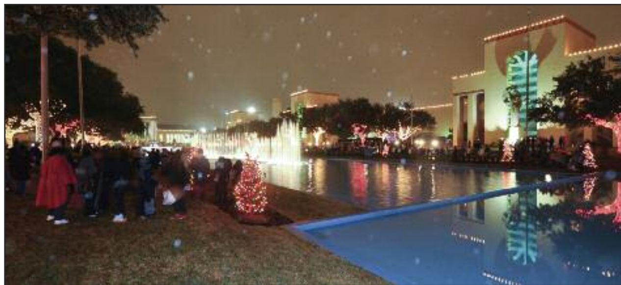
Scenes from last year's event.

Inside the Centennial Building, children and adults will flock to Santa's Workshop for free arts and crafts activities, such as ornament making, do-it-yourself gift wrapping and