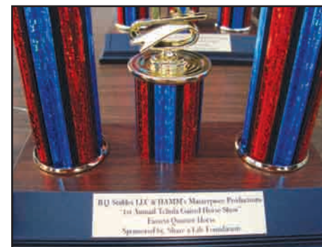
Share A Life Foundation sponsored the Tchula, MS Fastest Quarter Horse for 2011.

unteers. Our Mailing Address is P.O. Box 815131, Dallas, Texas 75381; phone number is (800) 509-2277 or (214) 537-1824. We can also be reached by email at agates@sharealife.org or info@sharealife.org . Our Website is www.sharealife.org .