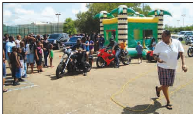
School children getting rides on motorcycles and in the bounce house after picking up supplies for a day of fun and excitement.