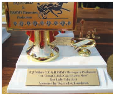
Share A Life Foundation sponsored the Tchula, MS Best Lady Horse Rider for 2011 in their 1st Annual Gated Horse Show.