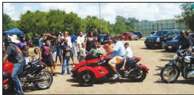
Back to School Drive with Multiple Motorcycle Clubs taking the kids on a ride around the facility parking lot after receiving their school supplies.