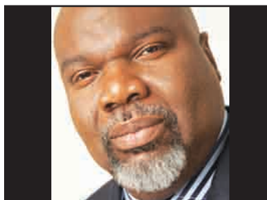
Bishop T.D. Jakes