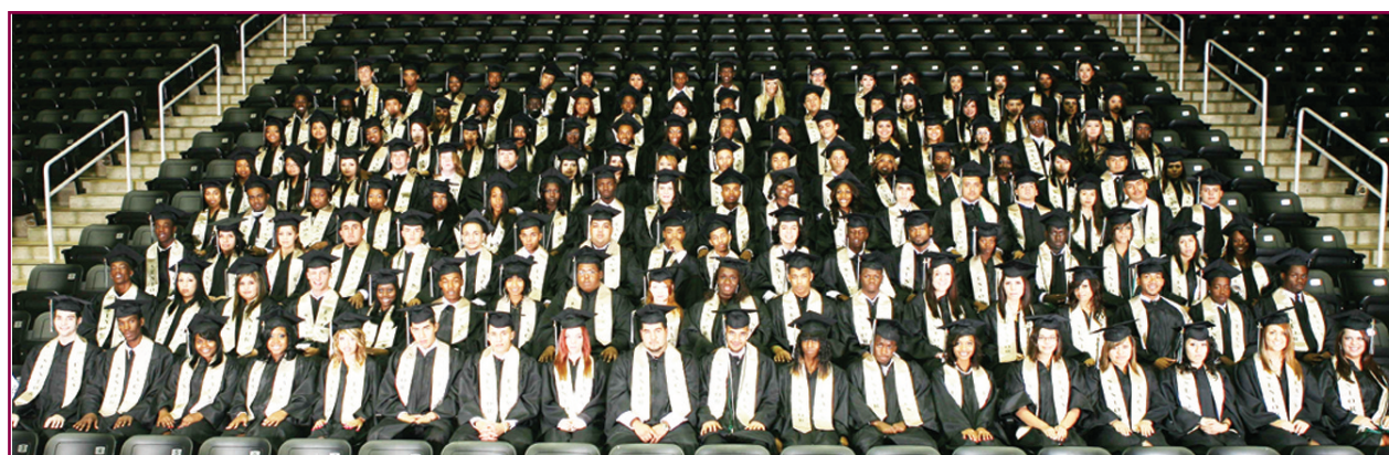
Evolution Academy Charter School Class of 2011