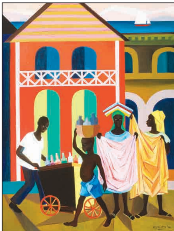
Loïs Mailou Jones, Street Vendors, Port au Prince, Haiti, 1978. Acrylic.

During a brief teaching stint at Palmer Memorial Institute, a preparatory school in Sedalia, North Carolina, Jones created