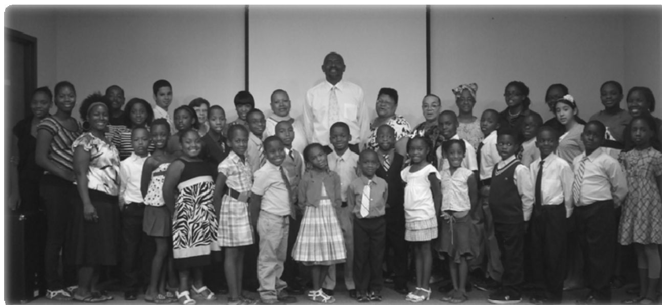
Bear Creek Reading staff and students on Dress For Success Day