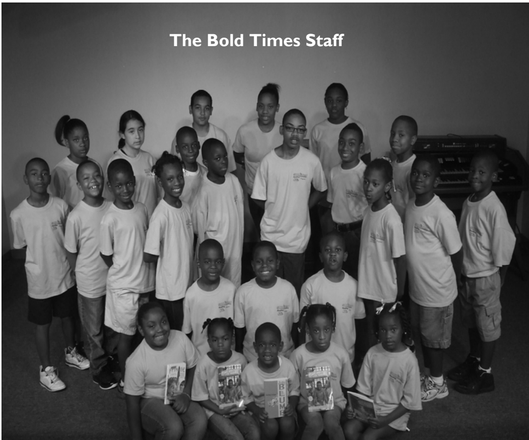
The Bold Times Staff