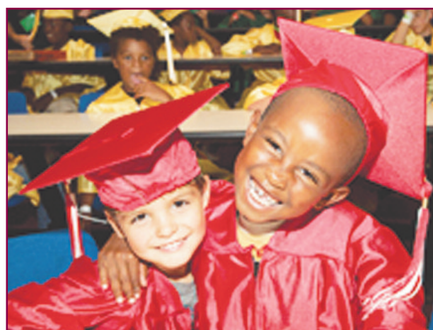
Graduates celebrate the end of a fun-packed four days.