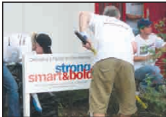
Volunteers from DG Publishing, Telligent, Hunt Investment Group and other companies help to landscape, organize cabinets and paint at mural at Girls Inc. during Entrepreneurs for North Texas' 2010 Freedom Day.

For the tenth consecutive year since the tragedy that struck America through terrorism, hundreds of business owners and their teams from across North Texas will volunteer to give back to Dallas through the Entrepreneurs for North Texas' (EFNT) Freedom Day.