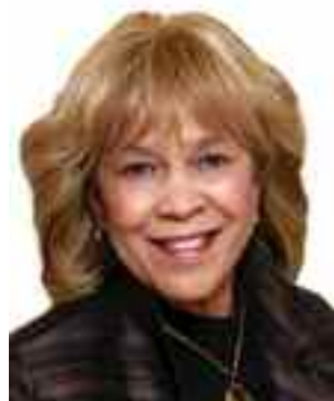
Rep. Helen Giddings

Although confrontations between police and communities have grabbed headlines across the nation, Texas is now leading by example in solving the problem.