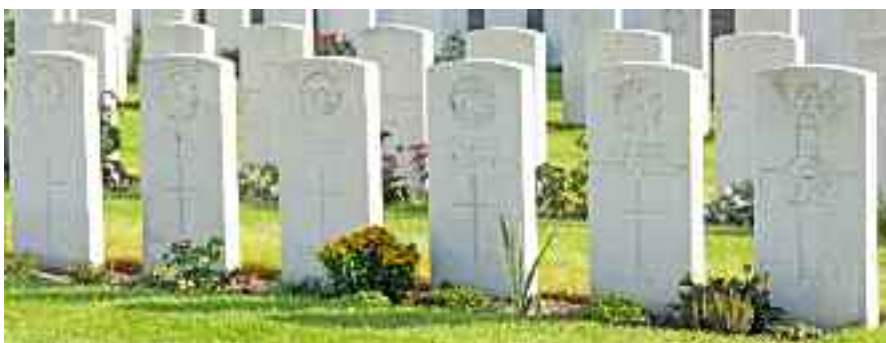
Dennis Jarvis / Flickr

Laurel Land Cemetery charges for cost of single Plot: $3995.00 Discount Amount, if you act right away: <$1995.00> (your savings) Your Cost: $2000.00 (financing available)