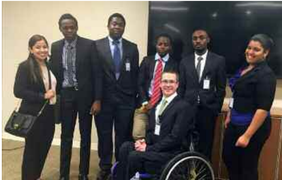
Brookhaven students are dressed to pitch their proposals to Sharyland.

"The topics used in the student presentations such as the drone project are ideas that allow Sharyland