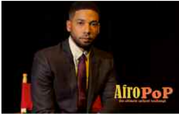
Jussie Smollett will anchor the eighth season of this enlightening documentary series.

"The scale and sheer numbers of immigrants from Mexico and Central