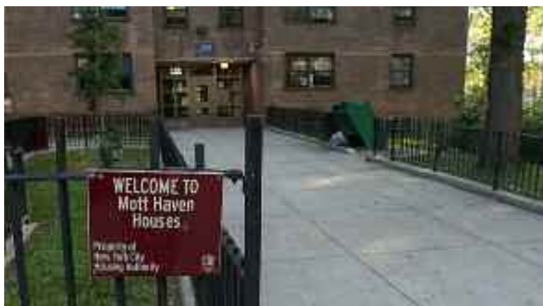
Housing complexes meant to serve the economically disadvantaged are often being occupied by well-heeled tenants.

As a result, one Manhattan family living in public housing earned $498,000 in 2014 – $431,000 more than the $67,000 income ceiling allowed. The family paid just $1,574 a month for a three-bedroom apartment in the financial district, where equivalent monthly rents exceed