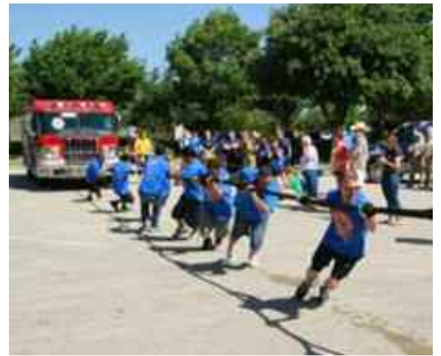
Contestants can test their strength against a fire engine in a competition to benefit Special Olympics on May 21.

Participants will receive a free hamburger, courtesy of In-N-Out Burger.