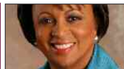
Dr. Carla Hayden

On the GO??? But still need to be in the KNOW!!! Bookmark NorthDallasGazette.com on your phone or mobile device!!!