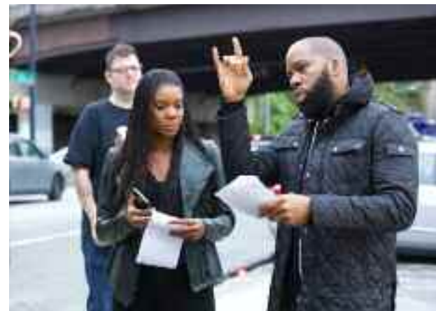
David E. Talbert (at right) gives instructions on set to Gabrielle Union (left) during recent filming.