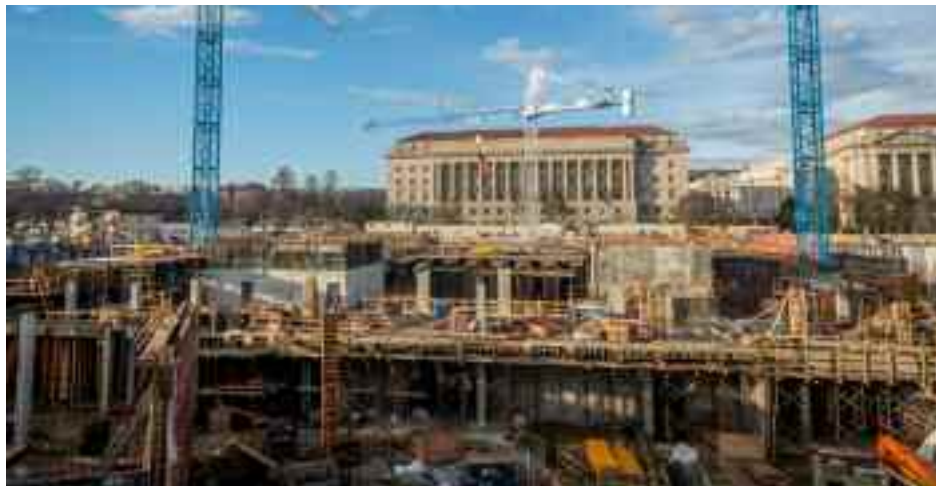
The nation's museum to the African American experience has been long-awaited, with large amounts of public attention being paid to every step of its construction.