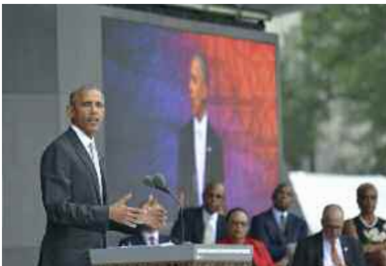
President Barack Obama speaks during the grand opening ceremony of the National Museum of African American History and Culture (NMAAHC) in Washington, D.C. The NMAAHC is the first Smithsonian museum focused on Black History on the National Mall.