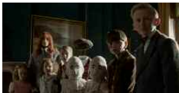
Tim Burton's latest creation features a cast of youngsters with bizarre traits that make them unable to live among mere humans. It is based on a popular novel

This time it's an American kid that gets to make the trip, but in order to do so he has to go hang out with some British kids. And this time it is being conjured up