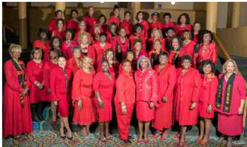
The historic South Dallas Business and Professional Women’s Club held its 64th Annual Founders’ Day celebration in DeSoto.