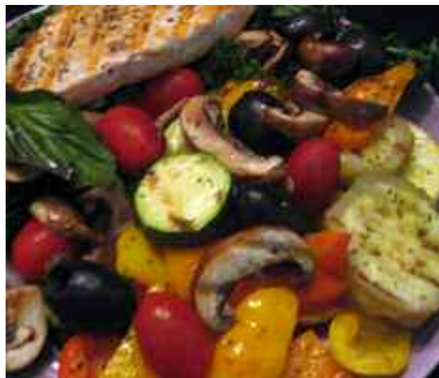
American Heart Association

The study included 107 healthy but overweight participants, ages 18-75, who were randomly assigned to follow for three months either a low-calorie vegetarian diet, which included dairy and eggs, or a low-calorie Mediterranean diet for three months. The Mediterranean diet included poultry, fish and some red meat as well as fruits, veg-