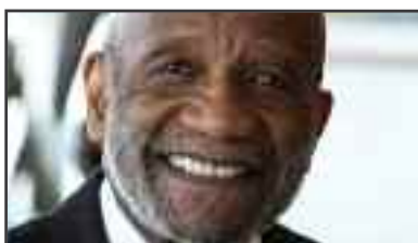
Lerone Bennett, Jr.