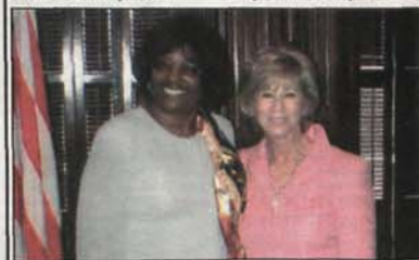
Sister Terley, Religious Editor for MON-The Gazette and Governor for a Day, Senator Florence Shapiro.

"During those years I have tried to give voice to your values... to make your aspirations my agenda; from education to transportation, homeland security to the safety of our children. I always think about your values."