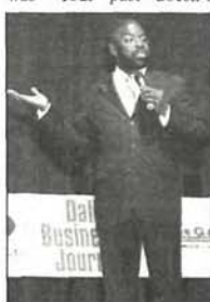
Les Brown speaks to an enthusiastic and motivated audience during motivational series "Bringing Out The Millionaire in You" at the Eisemann Center.