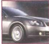
2005 Nissan Altima SE-R