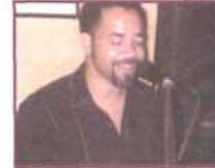
Trust His Promises

A Division of MON Minority Opportunity News, Inc.