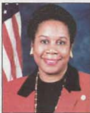
Representative Sheila Jackson Lee (D-TX)

Our country has generally relied on three strategies for dealing with youth gangs: suppression, which has meant longer criminal sentences and penalties; intervention, through job training, education and skills development in an attempt to reform gang members; and prevention, through school and community-based programs.