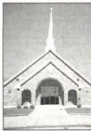
50 years of faith: The recently paid for Kaiser Street Baptist Church of Garland

Through the efforts of dedicated members, deacons and pastors, Kaiser Street Baptist Church is both financially stable and continuing their walk up the staircase of faith.