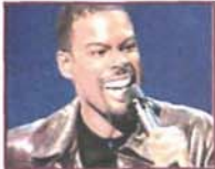
New Chris Rock Show to Debut on UPN