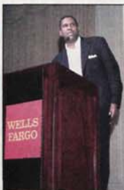
Tavis Smiley delivers the keynote address to an overflow audience.