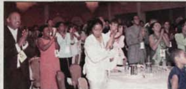
Tavis Smiley receives a standing ovation after delivering an inspiring speech.

National television and radio host Tavis Smiley was the Keynote Speaker at the Wells Fargo Wealth Building Strategies Seminar held on Saturday, August 6th at the Fairmont Hotel in Dallas. Experts were present at the seminar to give firsthand knowledge on