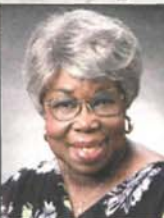
First on her agenda is getting a street in Denton named