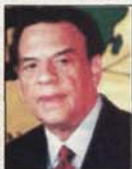
Ambassador Andrew Young

(Andrew Young is the former U.S. Ambassador to the UN and Chairman of Goodworks International. Bishop T.D. Jakes is the founder and senior pastor of the 30,000-member Potter's House.)