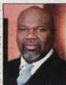
Bishop T.D. Jakes

Send your church announcements to: religion@monthegazette.com or fax to 972-516-1197 c/o Church Happenings. Deadlines are Fridays before publication date. (MON-The Gazette is published each Thursday.)