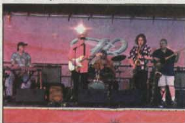
The Up All Night Blues Band takes it home.