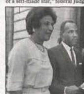
Constance Baker Motley with client James Meredith, 1962.