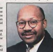
HUD Secretary Alphonso Jackson