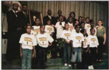
Dignitaries, staff and students stand with official portrait of Supreme Court Justice Thurgood Marshall.

Also participating in the ceremony were students who presented highlights about the life of Marshall and sang several songs including the official school song.