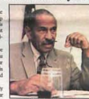
U.S. Rep. John Conyers