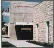
Thurgood Marshall Elementary School