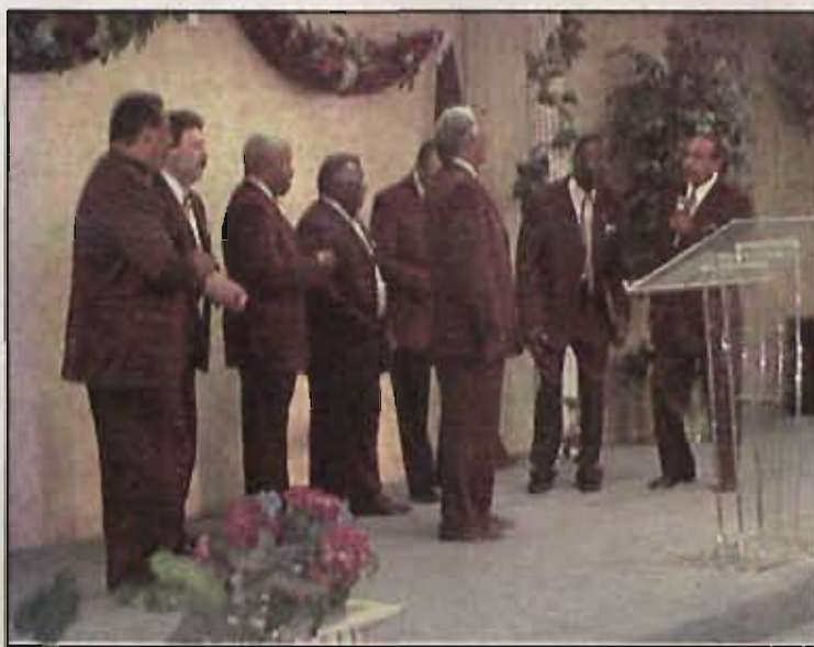
Hill Chapel CME Church Male Chorus