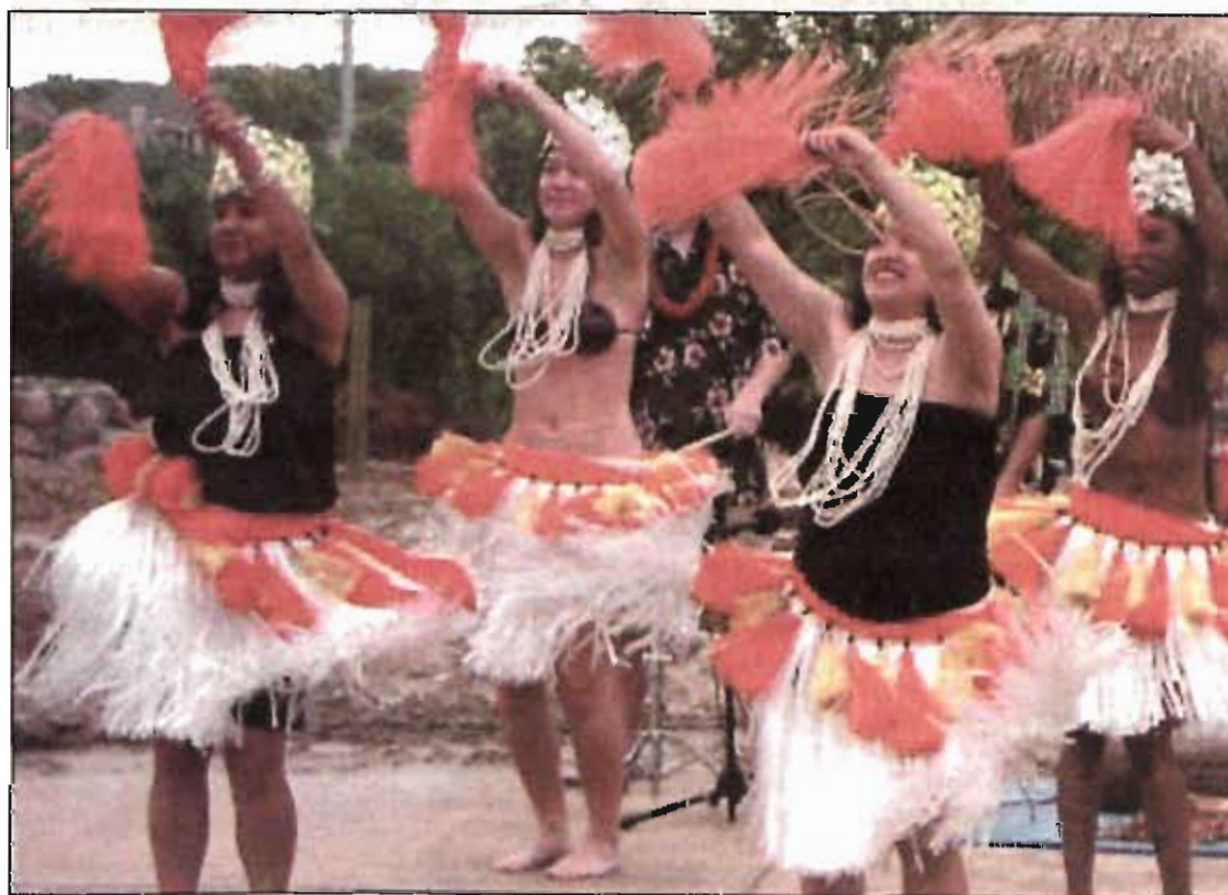
Hawaiian Dancers perform during the grand opening of Hawaiian Adventure Park.