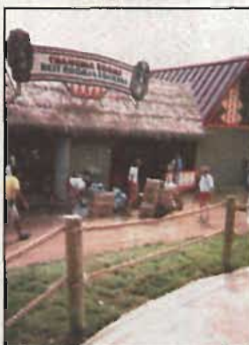
Workers prepare for grand opening.