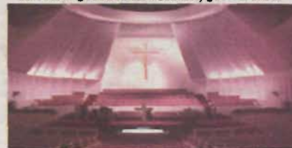
"Where Jesus is the Main Attraction"

Sunday Worship Experience: 8:00 A.M. & 10:45 A.M. Wednesday Bible Study: 12:00 Noon & 7:00 P.M.