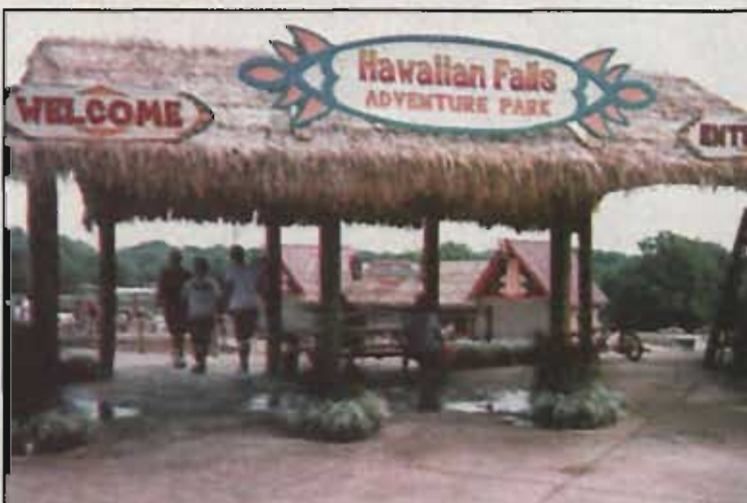
Local residents browse through the park to get a sneak preview of the waterpark before the grand opening.

(Garland, TX) Hawaiian Falls Adventure Park, the multi-million dollar family water park in north Garland, opened Sunday, May 25, 2003. The Grand Opening activities began at 11:30am with the park officially opening around 12:15pm.