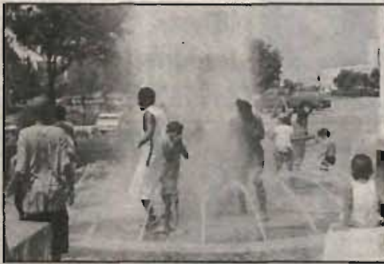
Kids take a run through the waterfall, escaping from the rising hot temperatures of Saturday.