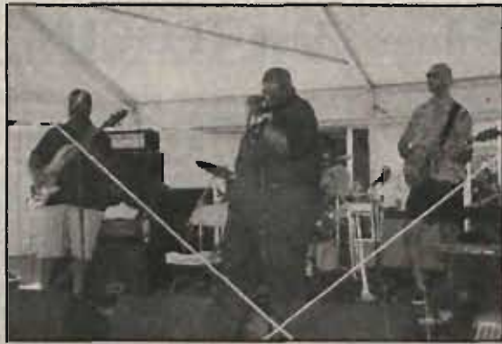
Big Jack and the Conspiracy Show Band performing at last Saturday's Juneteenth Celebration at Fair Park in Dallas.