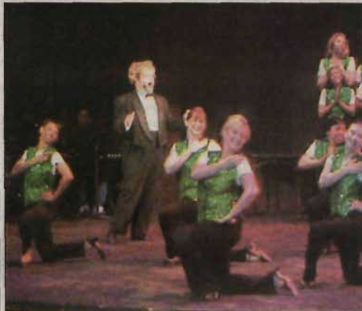
All I Care About (to the tune of the same name from CHICAGO)