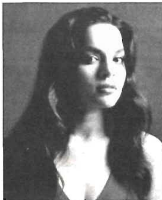
Sultry vocalist and pianist Norah Jones developed her unique blend of jazz and

both intriguing and comforting, she didn't really explore jazz until attending