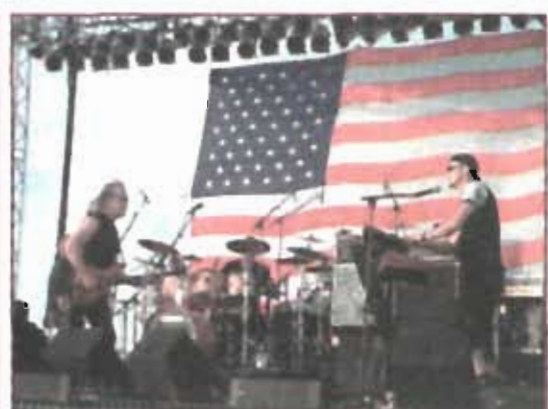
Popular 80s group, Loverboy performing at City of Allen's 50th Birthday

The City of Allen celebrated 50 years as a municipality on Saturday, June 28. Hundreds of local residents came out to enjoy the festivities while also celebrating the grand opening of Celebration Park. Popular 80s rock group, Loverboy performed on stage as well as J.T. Taylor, former lead singer of the legendary band, Cool and the Gang. Taylor performed many of the old favorites, including "Celebrate". Kids got a