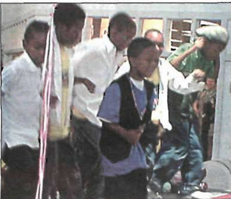
Kids from the Forest Lane Center groove to the sounds of The Jackson 5's hit, "I Want You Back"