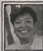
Eddie Bernice Johnson