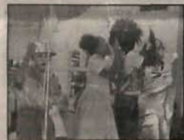
Northwest Highway Center & ShullmanAbrams Center performing their rendition of "The Wiz", lip-syncing to "Ease on Down the Road"