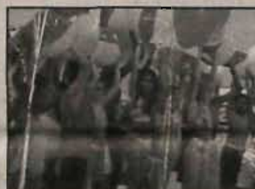
Beltline Center performs to "Surfing in the USA"

Sponsors for Puttin' on the Hits were Shine Plus, A&A Sales, and Creative Gift Basket.