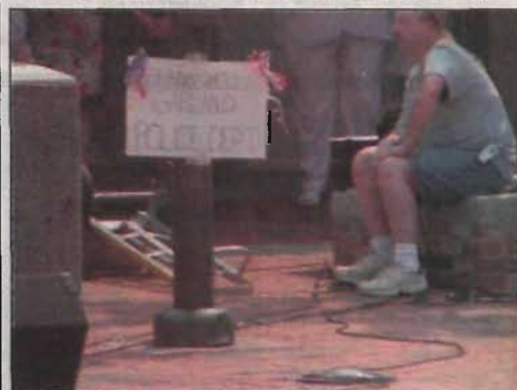
Local residents pay tribute to the Garland Police Department.